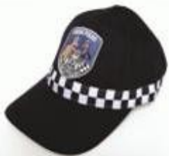
Junior Police Cap adjustable $15.00