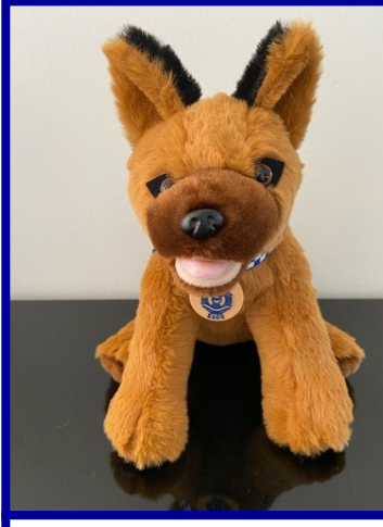
Police German Shepherd, named after QPS Police Dog Koas $20.00