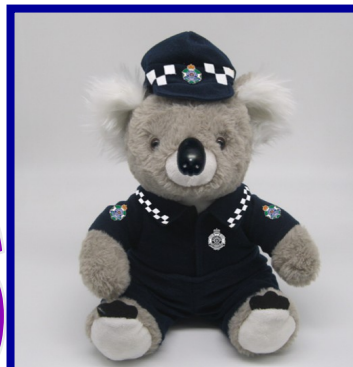
New Koala Cop $25.00