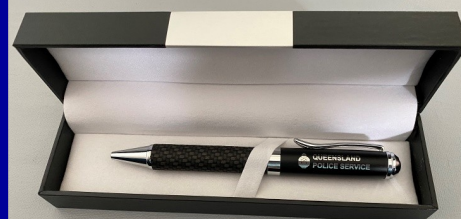
Queensland Police Service Corporate Pen in Presentation box $15.00 (Suitable for engraving great for graduation gift)