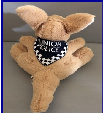
Plush Kangaroo with Junior Police bandana $12.00