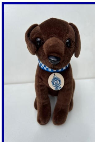
Police Labradors Dogs (named after QPS working dogs) $15.00