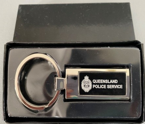
Queensland Police Service Key Ring $5.00 (Suitable for engraving great for graduation gift)