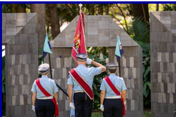
(above) Colour party at the Brisbane Botanical Gardens NPRD Service 29 September 2025