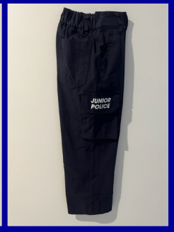
Junior Police Cargo Pants children's size 2 to 12 $30.00