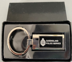
Queensland Police Service Key Ring $5.00 (Suitable for engraving great for graduation gift)