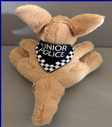
Plush Kangaroo with Junior Police bandana $12.00