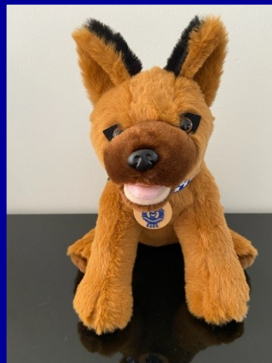
Police German Shepherd, named after QPS retired working dog $20.00