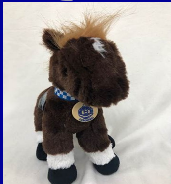
Geronimo named after retired Mounted Unit Police Horse $15.00