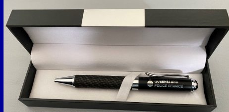
Queensland Police Service Corporate Pen in Presentation box $15.00 (Suitable for engraving great for graduation gift)