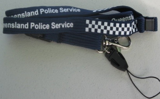
QPS Lanyard $5.00