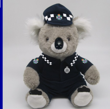
New Koala Cop $25.00