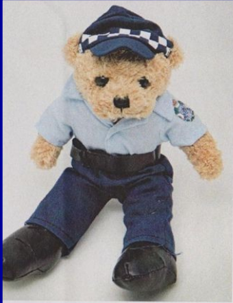
Plush Junior Police Teddy $15.00