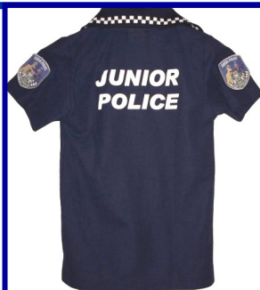
Junior Police Polo slim fit children's size 2 to 12 $30.00