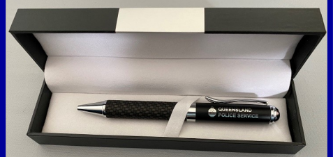
Queensland Police Service Corporate Pen in Presentation box $15.00 (Suitable for engraving great for graduation gift)