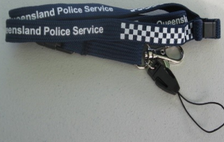
QPS Lanyard $5.00