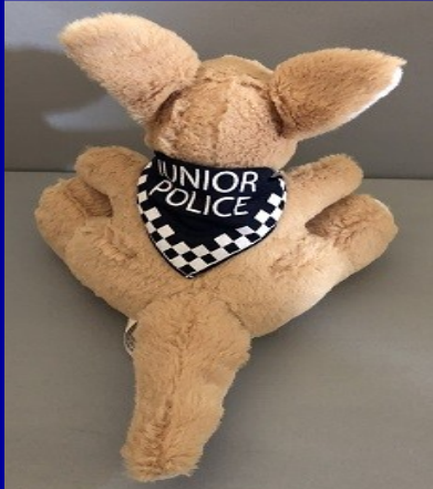
Plush Kangaroo with Junior Police bandana $12.00