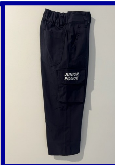
Junior Police Cargo Pants children's size 2 to 12 $30.00

The members of Community Supporting Police sincerely thank you for purchasing our unique CSP merchandise.