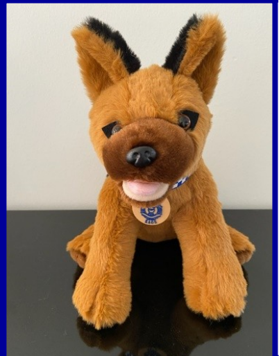
Police German Shepherd, named after QPS retired working dog $18.00