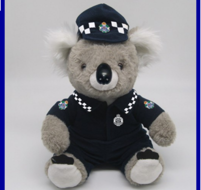
New Koala Cop $25.00