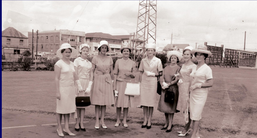
above) First sworn female officers graduation ceremony – 1965 and in June 1965, the first uniformed female officers joined the Service

https://mypolice.qld.gov.au/news/2025/03/31/qps-honours-60-years-of-women-in-policing-