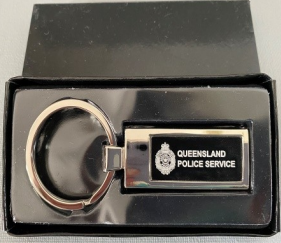
Queensland Police Service Key Ring $5.00 (Suitable for engraving great for graduation gift)