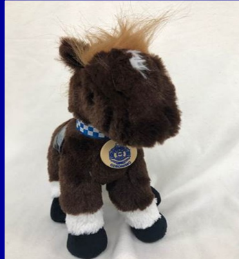
Geronimo named after retired Mounted Unit Police Horse $15.00