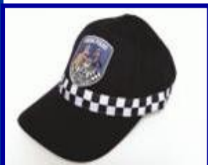
Junior Police Cap adjustable $15.00