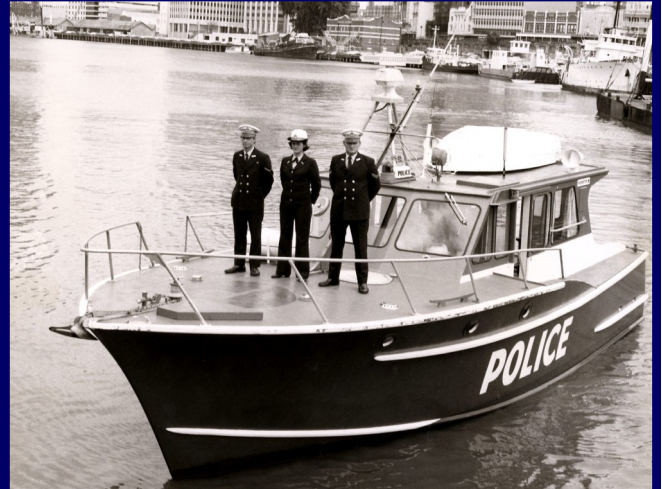
(above) 1974 First Woman to join the Water Police