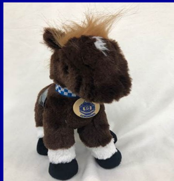
Geronimo named after retired Mounted Unit Police Horse $15.00