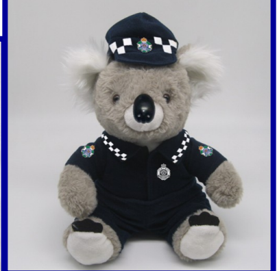
New Koala Cop $25.00