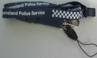
QPS Lanyard $5.00