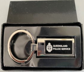
Queensland Police Service Key Ring $5.00 (Suitable for engraving great for graduation gift)