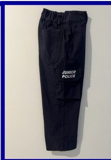
Junior Police Cargo Pants children's size 2 to 12 $30.00

The members of Community Supporting Police sincerely thank you for purchasing our unique CSP merchandise.