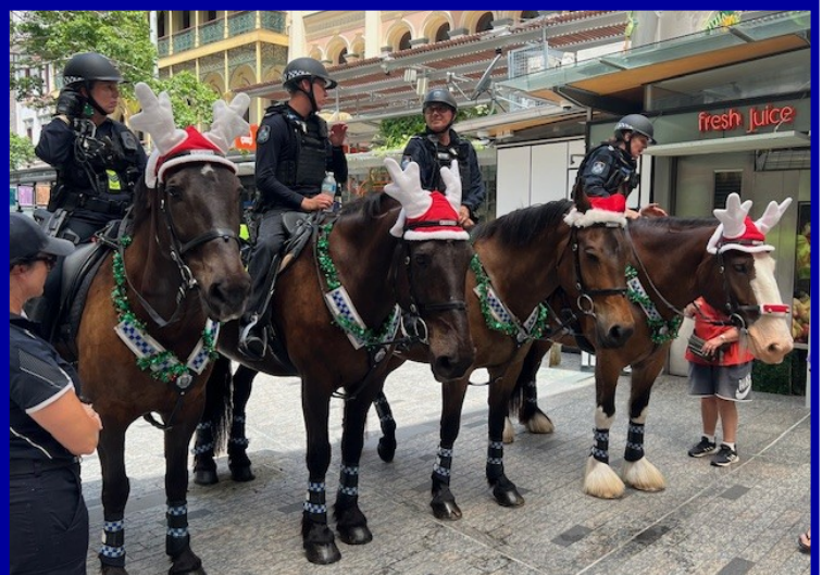
(Top) the mounted Unit attending the Commissioner's Carols, meeting and greeting members of the public in the Mall.