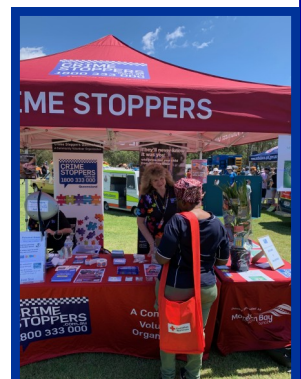
(above) Crime Stoppers Stand at the Chermerside Emergency Services Expo October 2024