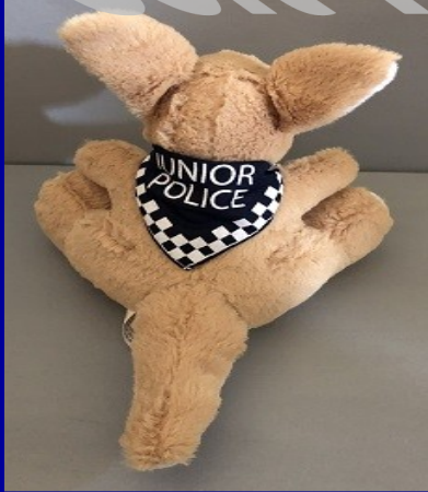
Plush Kangaroo with Junior Police bandana $12.00