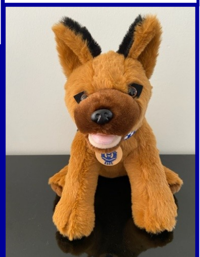
Police German Shepherd, named after QPS retired working dog $18.00