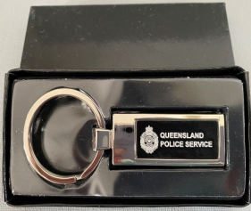
Queensland Police Service Key Ring $5.00 (Suitable for engraving great for graduation gift)