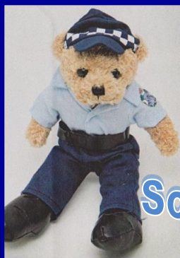
Plush Junior Police Teddy $15.00

(Photo left) sent in by a mum, who wrote "My son wore his police uniform for Bookweek at his kindy and it was a hit".