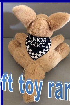
Plush Kangaroo with Junior Police bandana $12.00