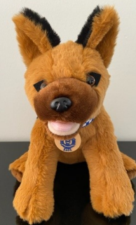
Police German Shepherd, named after QPS retired working dog $18.00