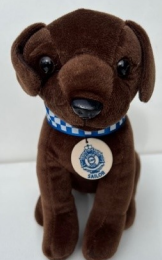
Police Labradors Dogs (named after QPS working dogs) $15.00