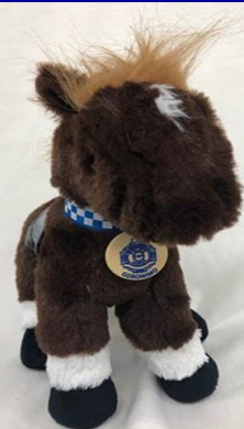
Geronimo named after retired Mounted Unit Police Horse $15.00