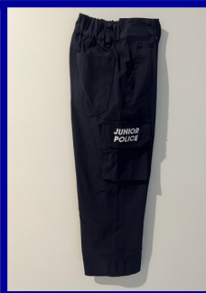
Junior Police Cargo Pants children's size 2 to 12 $30.00