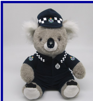
New Koala Cop $25.00

& at Police Headquarters Health and Recreation's QSHOP Roma Street