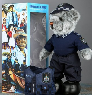
CONSTABLE T BEAR $45.00