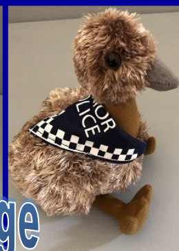
Plush Emu with Junior Police bandana $12.00