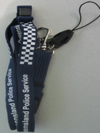
QPS Lanyard $5.00