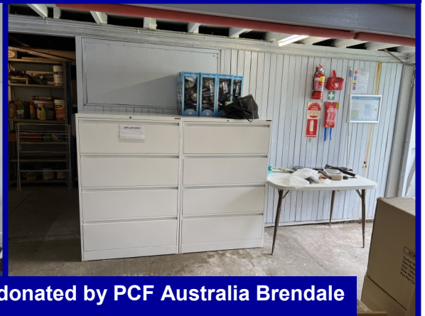
(above) New chairs and 4 drawer cabinets kindly donated by PCF Australia Brendale