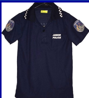
Junior Police Polo slim fit children's size 2 to 12 $30.00