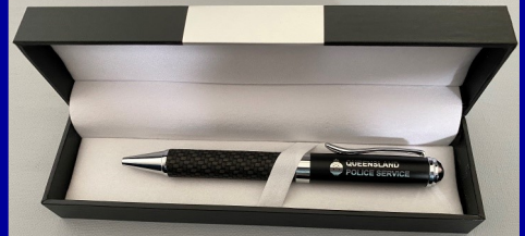
Queensland Police Service Corporate Pen in Presentation box $12.00 (Suitable for engraving great for graduation gift)

The members of Community Supporting Police sincerely thank you for purchasing CSP merchandise as it provides CSP the funding required to maintain emergency welfare accommodation for Police Service members and their families in times of trauma and or crisis