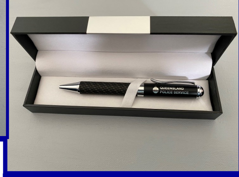
Queensland Police Service Corporate Pen in Presentation box $12.00

(Suitable for engraving great for graduation gift)