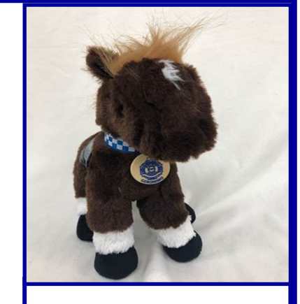
Geronimo named after working Mounted Unit Police Horse