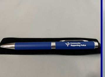
CSP Pen in Pouch $5.00

(Suitable for engraving great for graduation gift)