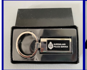
Queensland Police Service Key Ring $5.00

(Suitable for engraving great for graduation gift)