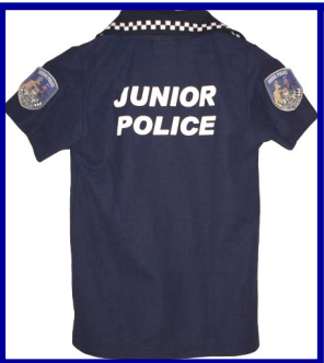
Junior Police Polo slim fit children's size 2 to 12 $30.00