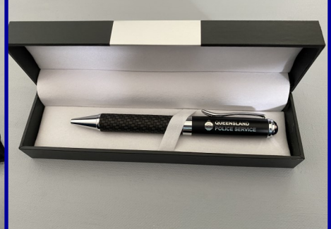
Queensland Police Service Corporate Pen in Presentation box $12.00

(Suitable for engraving great for graduation gift)