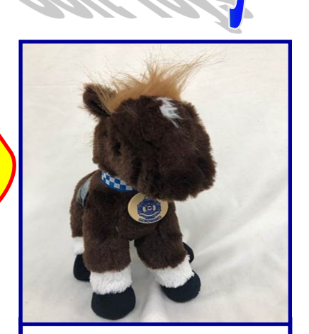
Geronimo named after working Mounted Unit Police Horse