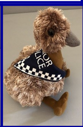
Plush Emu with Junior Police bandana $12.00