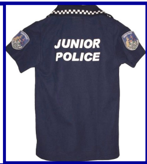
Junior Police Polo slim fit children's size 2 to 12 $30.00