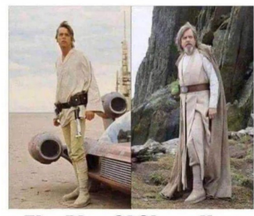
The Rise Of Skywalker

You know you're getting old when your belt has crept up above your belly button.