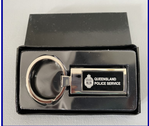
Queensland Police Service Key Ring $5.00 (Suitable for engraving