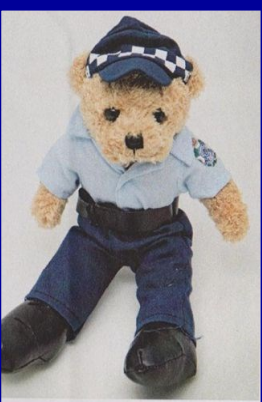
Plush Junior Police Teddy $15.00