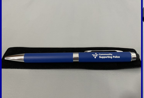
CSP Pen in Pouch $5.00