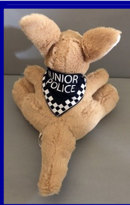
Plush Kangaroo with Junior Police bandana $12.00