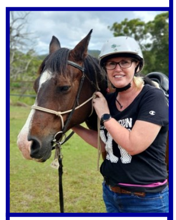
Ex-policer at Lauries Farm on a trail ride to thank volunteers from the RDA

I came to the RDA as a participant, and I was asked to be a volunteer. I am a medically retired Qld Police Officer and was looking for something that might help fill the void where my career had once been. I got more than I bargained for with the RDA. They enrolled me in their Equine Assisted Learning Program and miracles happened at "Lauries Farm". The horses have incredible abilities to perceive a person's emotional status and react to you in mind-boggling ways. The horses connect with you like no human can and they have inconceivably relieved my level of trauma. It has been such a rewarding experience. I love working as a volunteer and being with the other participants. I passionately love riding the horses and love just being at the RDA where the environment is one of motivated people wanting to help others. I feel such gratitude that I get to hang out with such a magnificent bunch of people and horses.