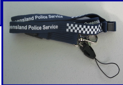
QPS Lanyard $5.00