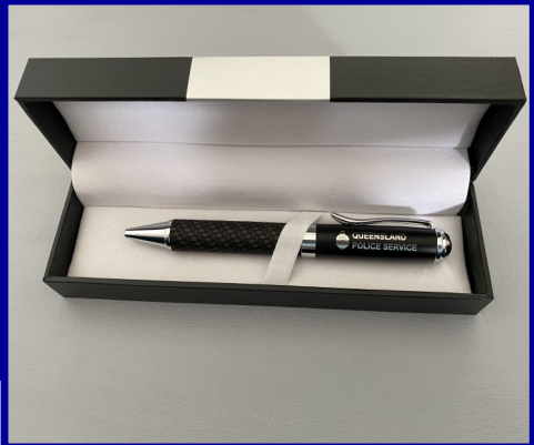
Queensland Police Service Corporate Pen in Presentation box $12.00 (Suitable for engraving great for graduation gift)