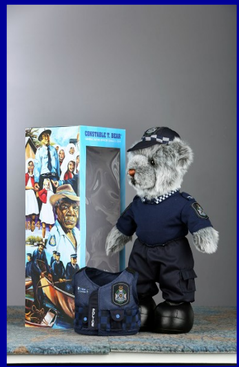
CONSTABLE T. BEAR $45.00