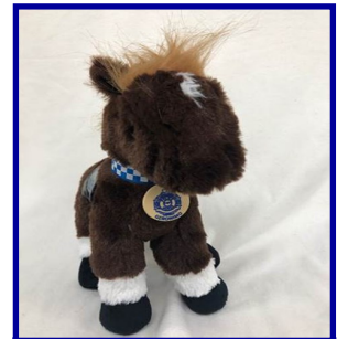
Geronimo named after working Police Horse $15.00

The members of Community Supporting Police Inc sincerely thank you for purchasing CSP merchandise as it provides CSP the funding required to maintain emergency welfare accommodation for Police Service members and their families in times of trauma and or crisis