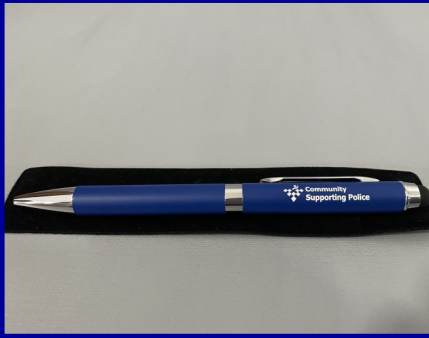
CSP Pen in Pouch $5.00