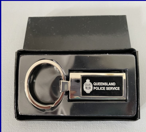
Queensland Police Service Key Ring $5.00 (Suitable for engraving great for graduation gift)