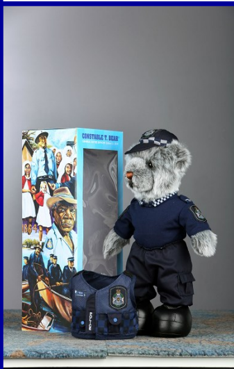
New Koala Cop