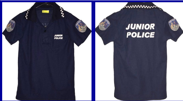
Junior Police Polo slim fit children's size 2 to 12 $30.00