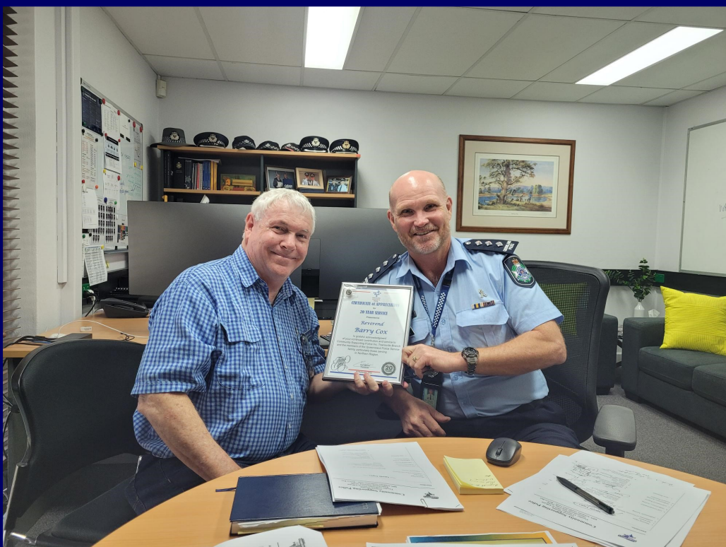
From Townsville (Photo left)