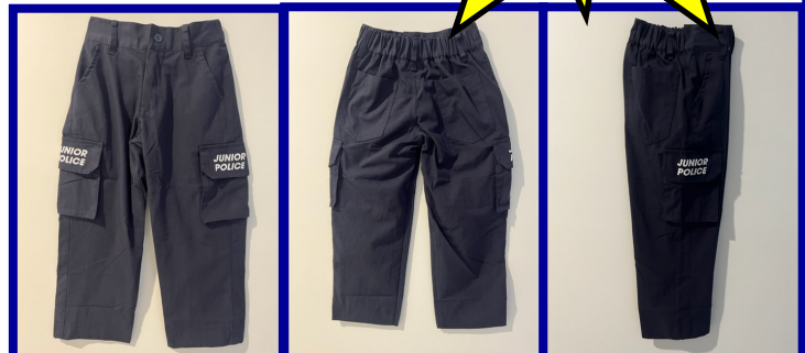
Junior Police Cargo Pants children's size 2 to 12 $30.00