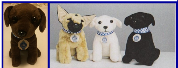
Police Dogs (named after QPS working dogs) $12.00

Products are available for purchase through the CSP online store www.csp.asn.au