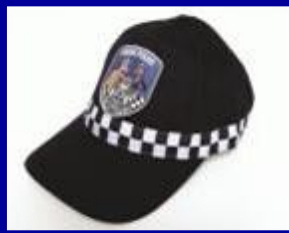
Junior Police Cap adjustable $10.00