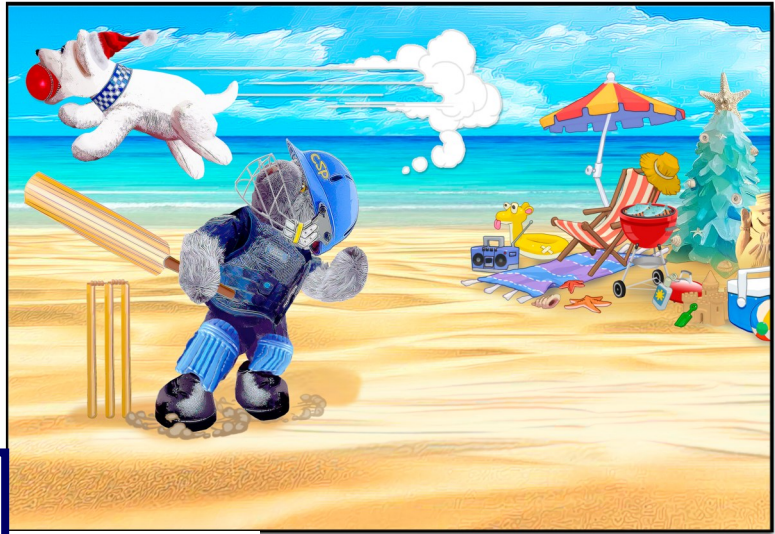
Pictures right and below courtesy of CSP's amazing member who produced the images of Constable T. Bear and Friends for our CSP 2021 calendar.

We hope you spend Christmas with families and friends, whether it is for activities in the wide open spaces (like Constable T. Bear a game of beach cricket or surfing the waves) or gathering in your home, we wish you all the best.