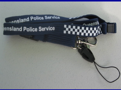
QPS Lanyard $5.00