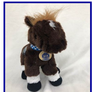
Geronimo named after working Police Horse $12.00

The members of Community Supporting Police Inc sincerely thank you for purchasing CSP merchandise as it provides CSP the funding required to maintain emergency welfare accommodation for Police Service members and their families in times of trauma and or crisis