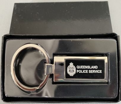
Queensland Police Service Key Ring $5.00. (Suitable for engraving great for graduation gift).