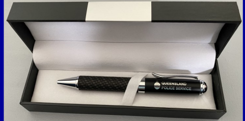
Queensland Police Service Corporate Pen in Presentation box $12.00 (Suitable for engraving great for graduation gift).