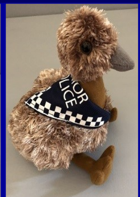
Plush Emu with Junior Police bandana $12.00