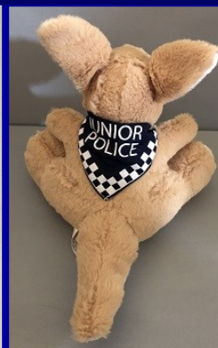
Plush Kangaroo with Junior Police bandana $12.00