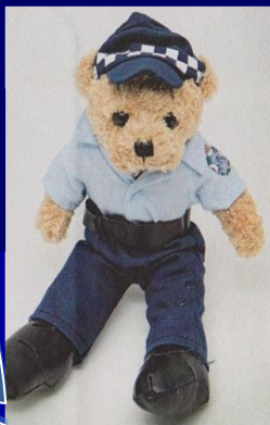
Plush Junior Police Teddy $15.00