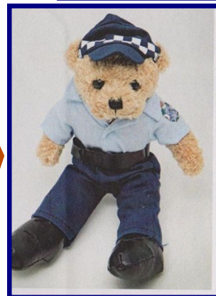
JP Teddy $12.00 if purchased before 31 December 2019 In 2020 JP Teddy will increase to $15.00 due to increased manufacturing costs.