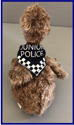
Plush Emu with Junior Police bandana $12.00 (16cm)