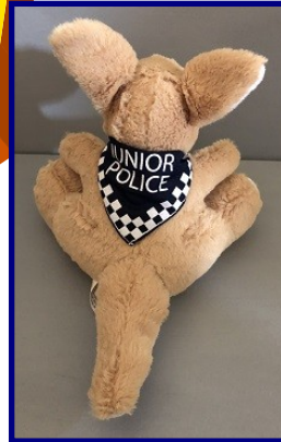
Plush Kangaroo with Junior Police bandana $12.00 (17cm)