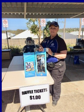
Browns Plains Emergency Services Day.