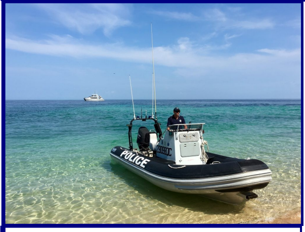
Cairns Water Police urge boaties to take precautions and secure vessels