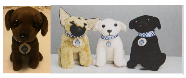
Police Dogs $12.00 (named after QPS working dogs)