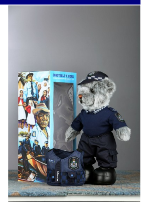
CONSTABLE T. BEAR 2014 $60.00