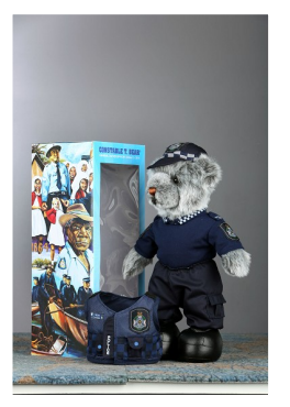
CONSTABLE T. BEAR 2014 $60.00